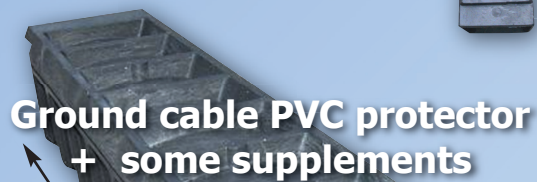
Ground cable PVC protector + some supplements